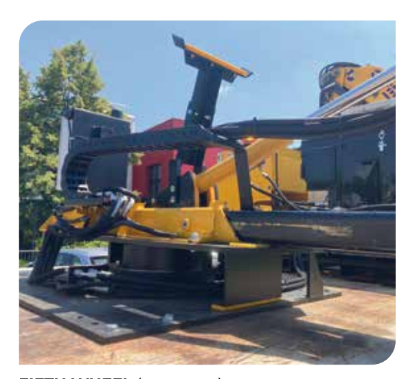
FIFTH WHEEL (accessory)