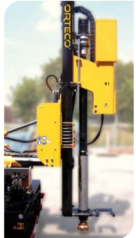
DOWN THE HOLE HAMMER (accessory)

New Stage 5 / Tier 4 final compliant engines, watercooled and equipped with a diesel particulate filter