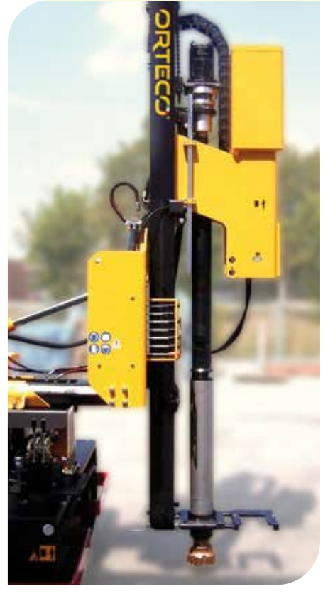
DOWN THE HOLE HAMMER (accessory)

New Stage 5 / Tier 4 final compliant engines, watercooled and equipped with a diesel particulate filter