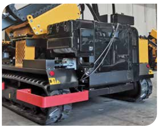
NEW POWER PACKS

New Stage 5 / Tier 4 final compliant engines, watercooled and equipped with a diesel particulate filter